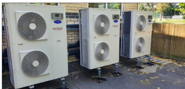
Caption: Air source heat pumps installed at Moss Hall Nursery as part of PSDS3a.

The total cost of the PSDS3a programme is estimated to be £12m. It will be funded via a combination of PSDS3a grant funding as well as s106 carbon offset fund and external borrowing.