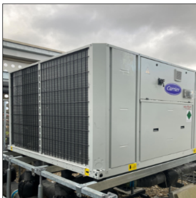
Caption: Battery storage installed through Public Sector Decarbonisation Scheme Phase 1.

1.1.9 The projects are estimated to achieve combined carbon savings of 286.7 tCO 2 e per annum and financial savings of up to £48k per annum.