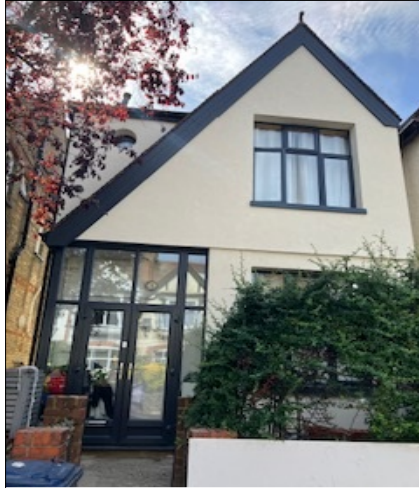
Caption: Front of the house with new double-glazed windows and porch, external wall insulation and rendering.

boiler and installation of an air source heat pump, external wall insulation, roof and loft insulation, solar photovoltaic panels, double glazing and replacement of the front porch. The main benefits of the scheme have been to learn valuable lessons on cost, quality control, attention to detail, cost effectiveness of interventions and to identify any unintended consequences that others can learn from. Overall, the tenant has been left with a warmer and healthier home that should be cheaper to heat, although that will only be possible to fully quantify the benefits in Spring 2024.